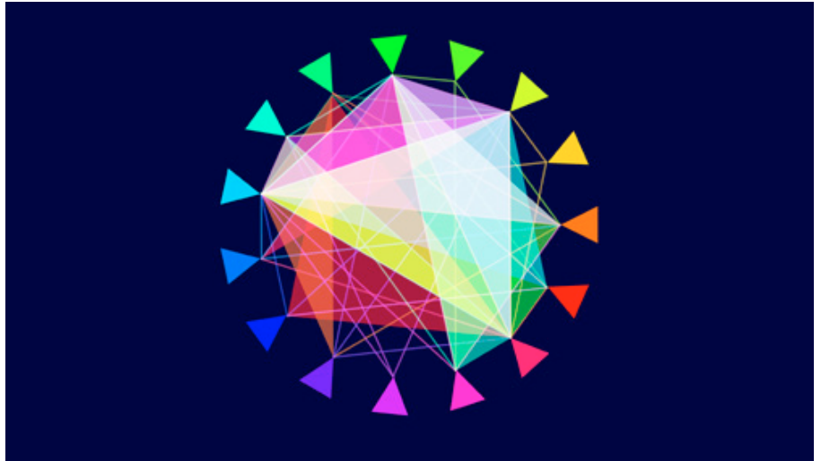
figure 1 - graphic of selection process from Curatron promotional video.

Invented by artist Cameron MacLeod, Curatron is an anonymous system of peer evaluation and selection, which enables a pool of artists to select co-exhibitors from amongst a group of applicants of which they are a part of. The prize sought out by the Curatron software is the algorithm for the perfect, or at least perfectly coherent, thematic group show. With the cooperation of human artists, this may just be achievable.