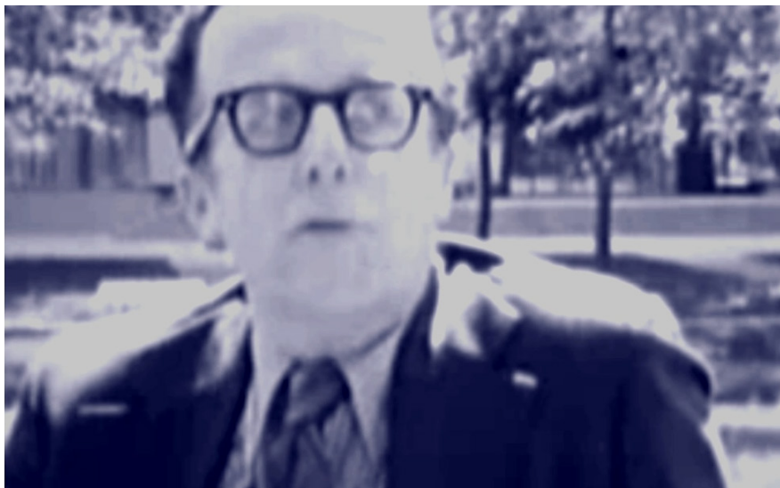
figure 2. J.C.R. LICKLIDER internet pioneer. Excerpt from Curatron promotional video appropriated from 1972 film "Computer Networks - The Heralds Of Resource Sharing"

Through a complex process of aggregation and comparison, these proposed groupings are automatically evaluated, and a final selection is made from the pool of applicants based on the most